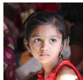
A gift for life: Jesus Youth Group India gave 75 children a health insurance

Sweets, toys or school necessities – that's what is usually on children's wish list for Christmas. 75 children under the care of H.O.P.E. received a completely different gift last Christmas. It did not come in a nice gift wrap, and it was not presented in a box. But it was probably the most precious gift these children ever received in their life – and one that will become more valuable as years go by.