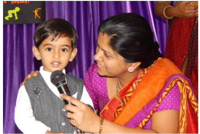
Blooming Buds nursery school of H.O.P.E. offers pre-school education for children age 2 years and above

Blooming Buds nursery school of H.O.P.E. celebrated its' annual day on 14 th November 2014 with some 30 children, staff and co-workers. For the first time, also the parents participated actively.