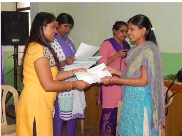
Skills trainings for women have been at the center of H.O.P.E.'s activities from the start

27 th November 2014 will surely be highlighted in the personal calendar of 80 women from Vadgaon Sheri: Convocation Day at H.O.P.E. center! All women who had recently successfully completed one of H.O.P.E.'s skills training courses had gathered to receive their personal certificates.