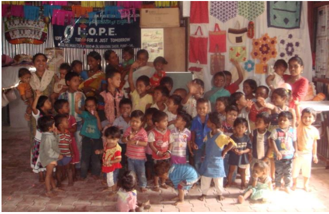
The day care center cares for 40 to 60 children from 0 to 14 years

H.O.P.E.'s day care center for children of migrant construction workers celebrates 10 years