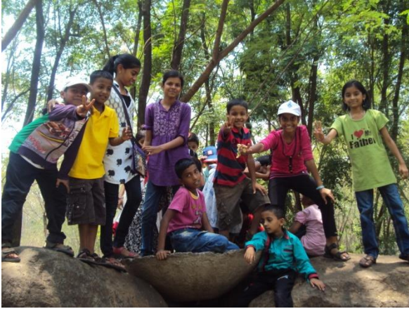
Every year, H.O.P.E. invites some 100 children from a less advantaged background to a week of joy and happiness

As it gets summer, the children of Vadgaon Sheri get excited – they know that there is something special coming up for them. 21 st April 2014, it was their turn: H.O.P.E.'s annual Summer camp for children started. A whole week of fun, laughter, happiness provided by H.O.P.E. for some 100 children from less advantaged background.