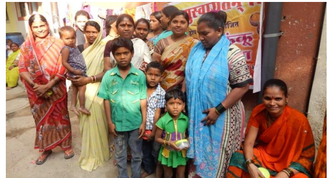
With the women from Laximi Nagar Slum, H.O.P.E. now reaches out to more than 650 domestic workers

End of October 2014, H.O.P.E.'s domestic workers solidarity group has become member of the National Domestic workers Action Committee. H.O.P.E. now represents domestic workers at State and national level demanding from the Government a separate law for domestic workers with all the security benefit schemes in favor of them.