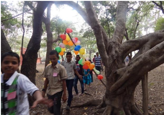
100 children enjoyed a day in the woods organized by De Nobili Brothers