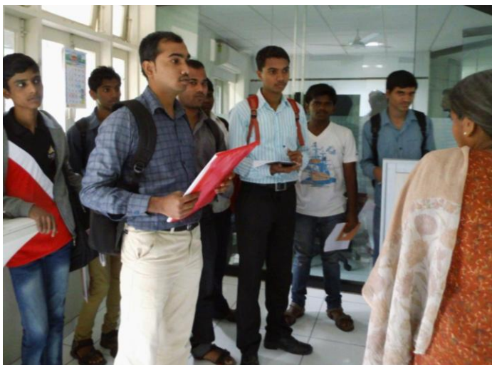
Parineeti offers young adults a customized 3 months training course

Joint project of H.O.P.E. and TESI Foundation