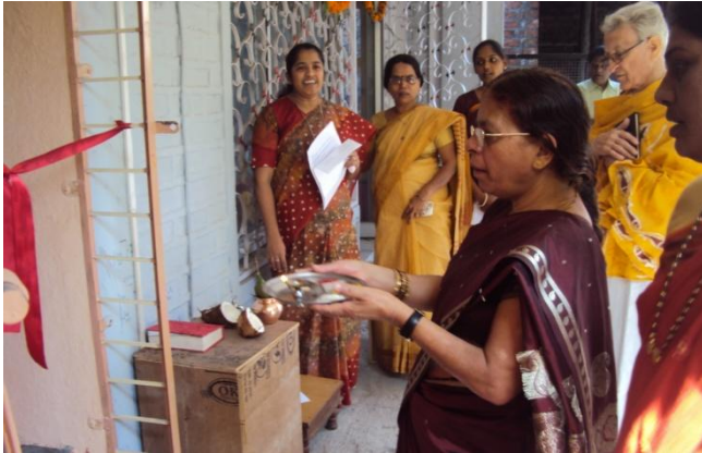
Kalpataru accommodates up to 12 girls and young women