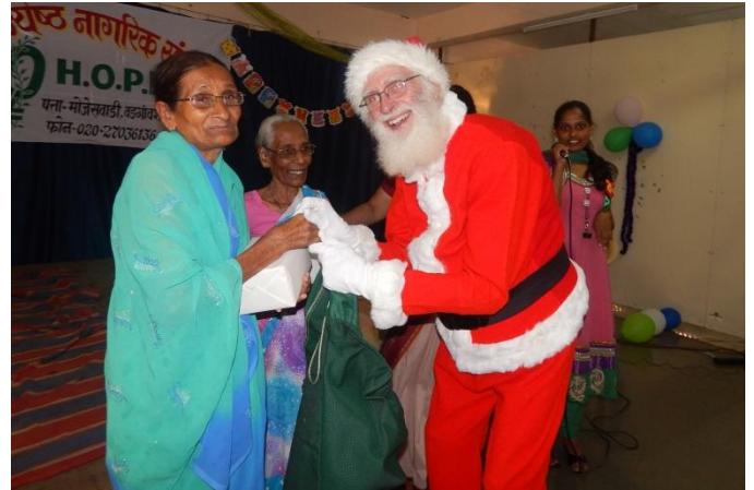
Santa is coming to town and paying visit to more than 100 senior Citizens under H.O.P.E.'s care

More than 100 senior citizen from Vadgaon Sheri and adjoining neighborhoods gathered on 16 th December 2014 in Christ the King Church Hall to celebrate Christmas Day. H.O.P.E. had invited the members of its' Senior Citizens Club to share an afternoon of joy in reference to the upcoming Christmas days.