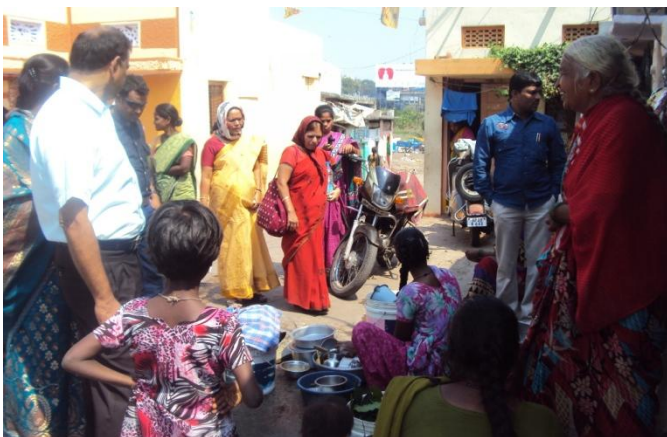
The 4-days visit to Hyderabad was the highlight of the numerous training programmes for the staff of H.O.P.E.

H.O.P.E. keeps its' staff fit with a variety of training programmes